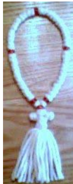
R004 with 4 extra glass beads & special Bead placement