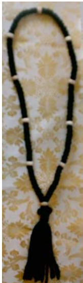
R005 with 6 Extra wood Beads

Custom Work bead placement is available on all prayer rope styles. We uniquely honor special requests for bead placement at no extra cost; and, make extra beads available for purchase for your own special design. R005 (100 knot prayer rope) normally comes with 4 beads and is shown in the image below customized with 6 extra beads. Extra beads are available for all styles of prayer ropes offered.