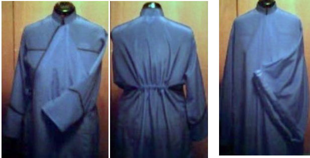
Anterri Front Anterri Back Exorasson